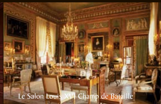
Le Salon Louis XVI Champ de Bataille